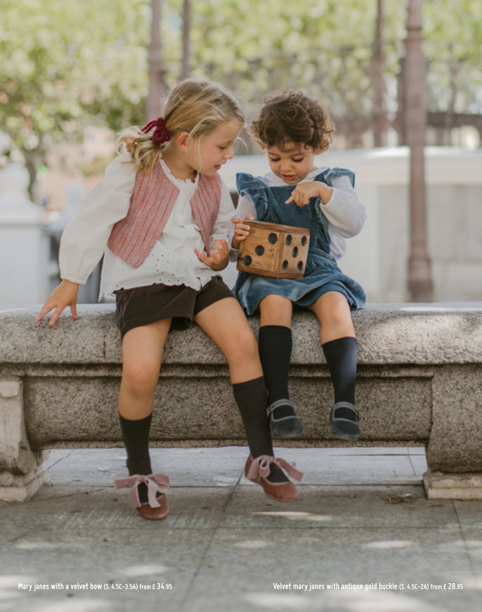
Mary janes with a velvet bow (S. 4.5C-3.5A) from £ 34.95