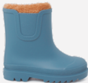
Wellies with fur lining (S. 5.5C-13C) £ 38.95