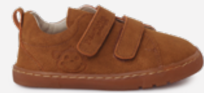
Barefoot trainers with embossed leather effect (S. 3.5C-11.5C) from £ 52.95