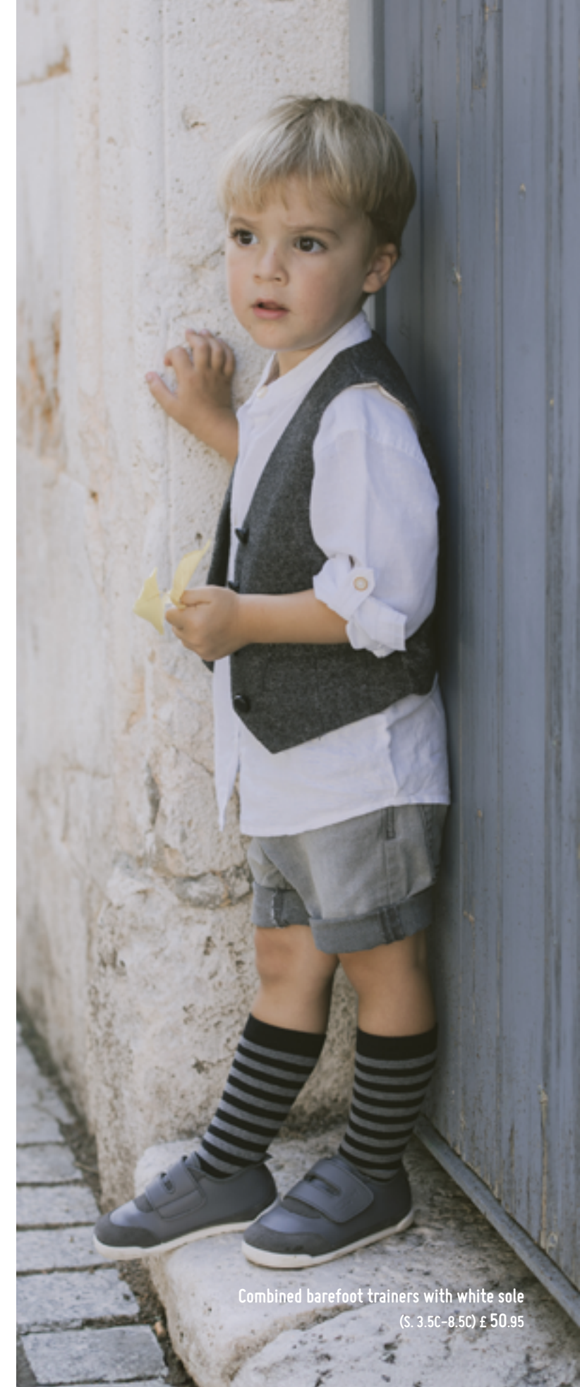
Combined barefoot trainers with white sole (S. 3.5C-8.5C) £ 50.95