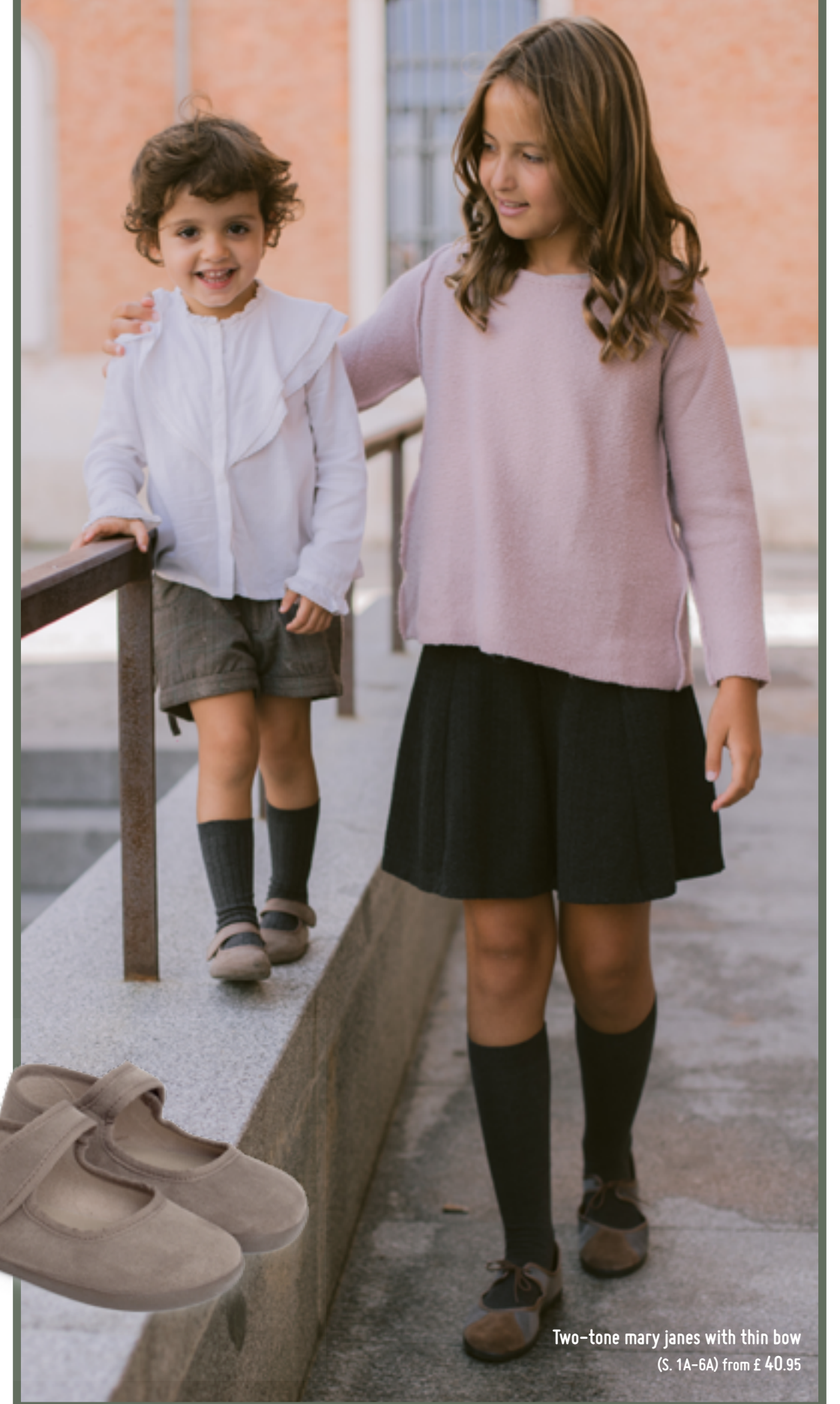
Two-tone mary janes with thin bow (S. 1A-6A) from £ 40.95