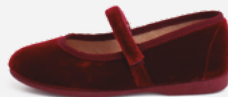
Velvet mary janes with hook-and-loop strap (S. 5.5C-2A) from £ 28.95