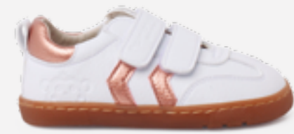
Barefoot trainers with metallic side stripes (S. 3.5C-11.5C) from £ 54.95