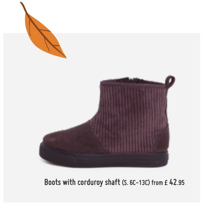
Boots with corduroy shaft (S. 6C-13C) from £ 42.95