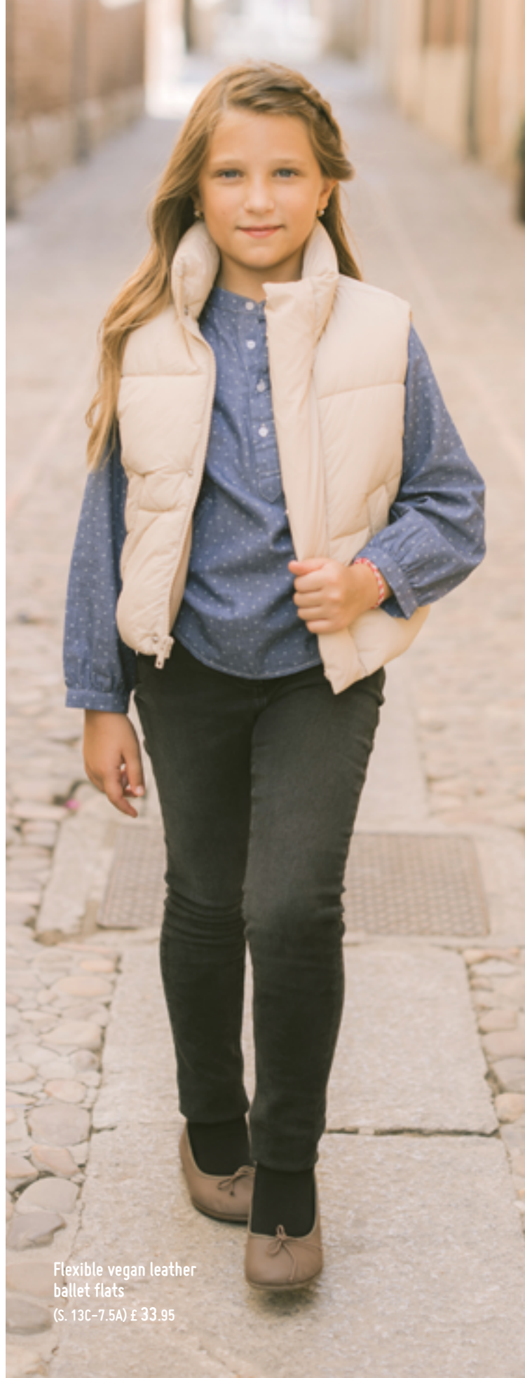
Flexible vegan leather ballet flats (S. 13C-7.5A) £ 33.95