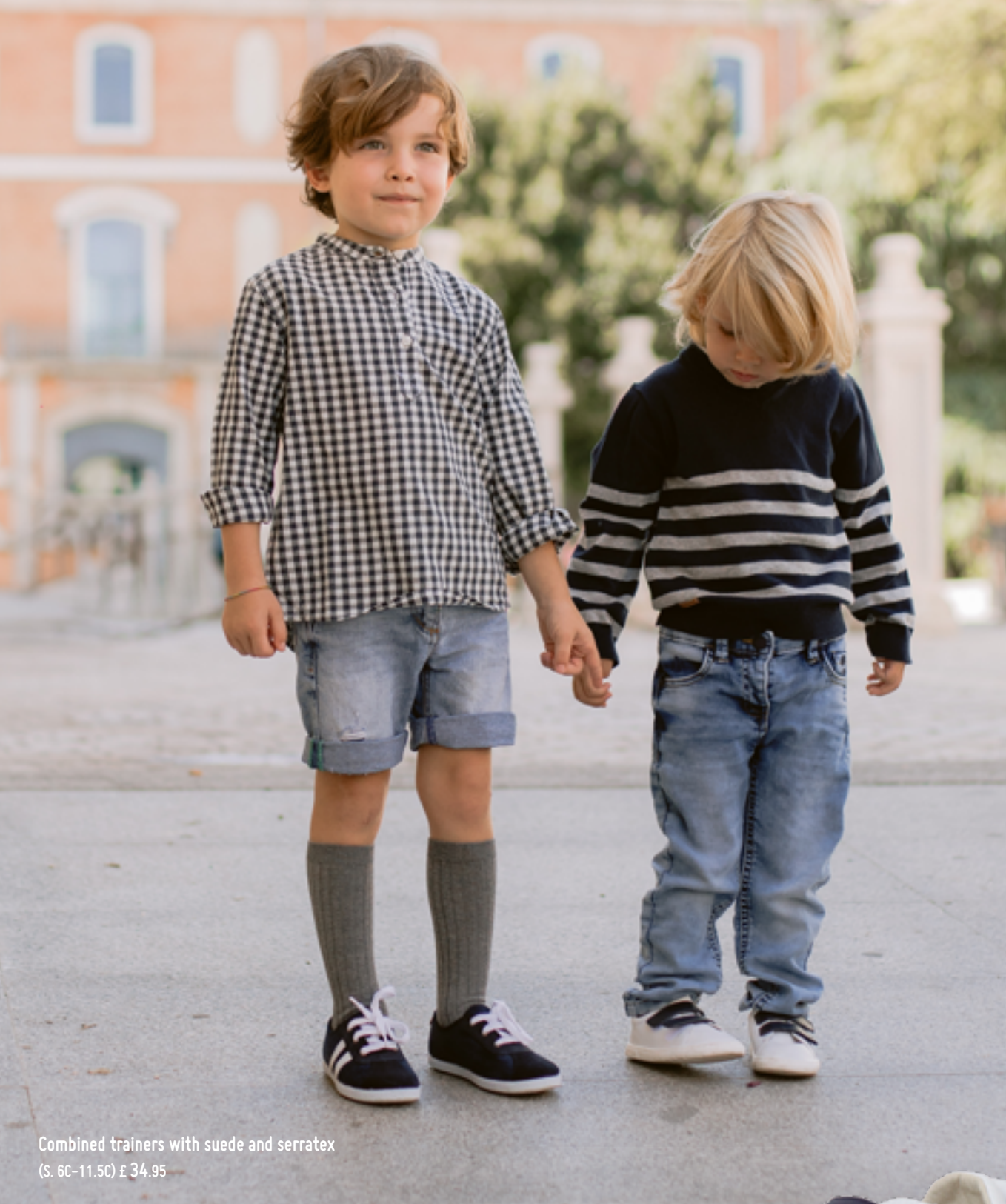
Combined trainers with suede and serratex (S. 6C-11.5C) £ 34.95