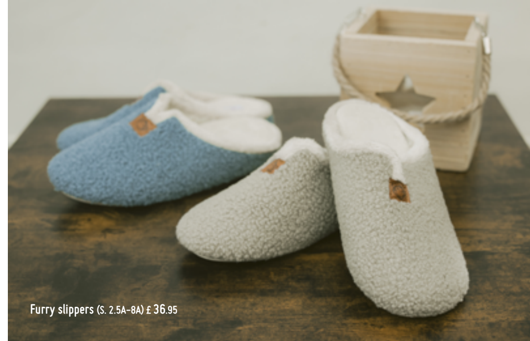
Furry slippers (S. 2.5A-8A) £ 36.95