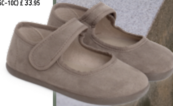
Barefoot serratex mary janes with hook-and-loop strap (S. 3.5C-10C) £ 33.95