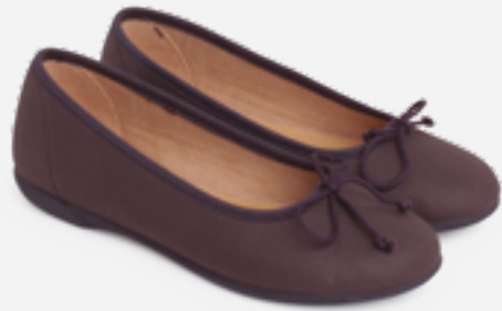
Flexible vegan leather ballet flats (S. 13C-7.5A) £ 33.95