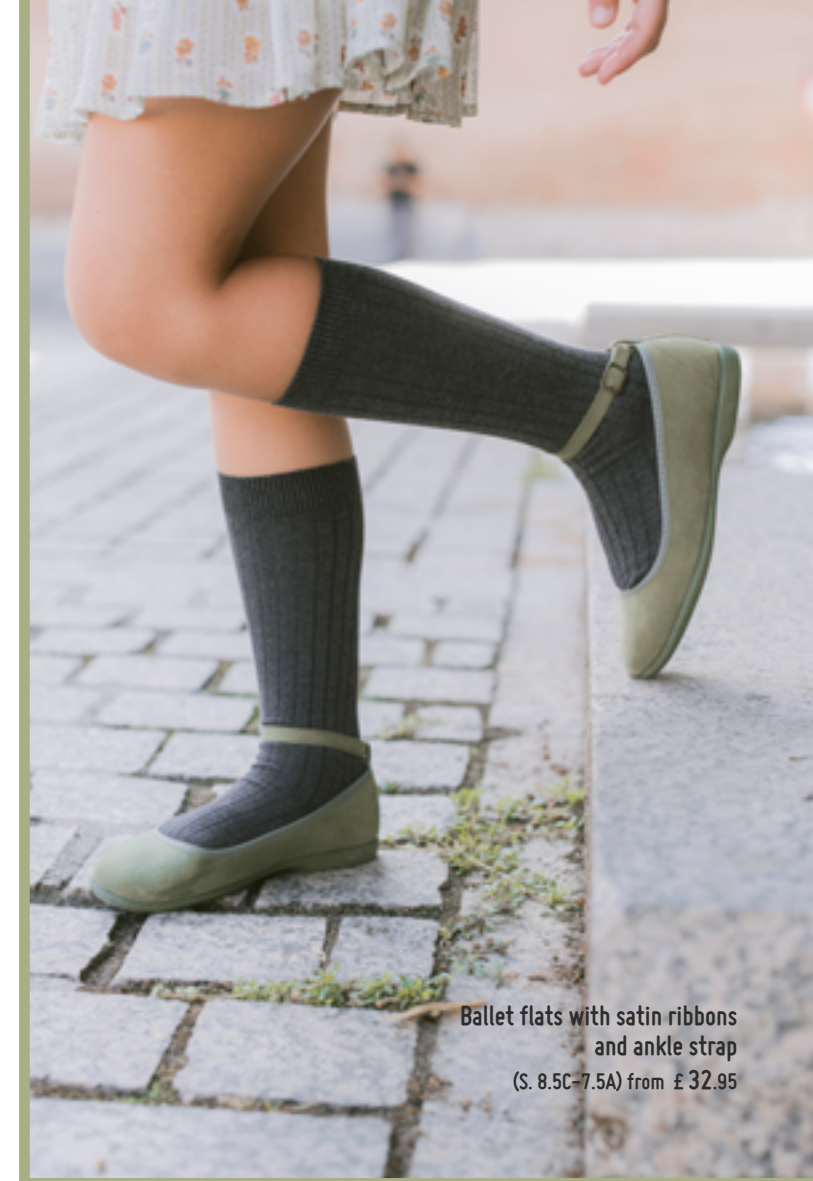
Ballet flats with satin ribbons and ankle strap (S. 8.5C-7.5A) from £ 32.95

Discover all the season's novelties, designed for your children's feet to grow happily, with options for the whole family! Don't miss the following pages.