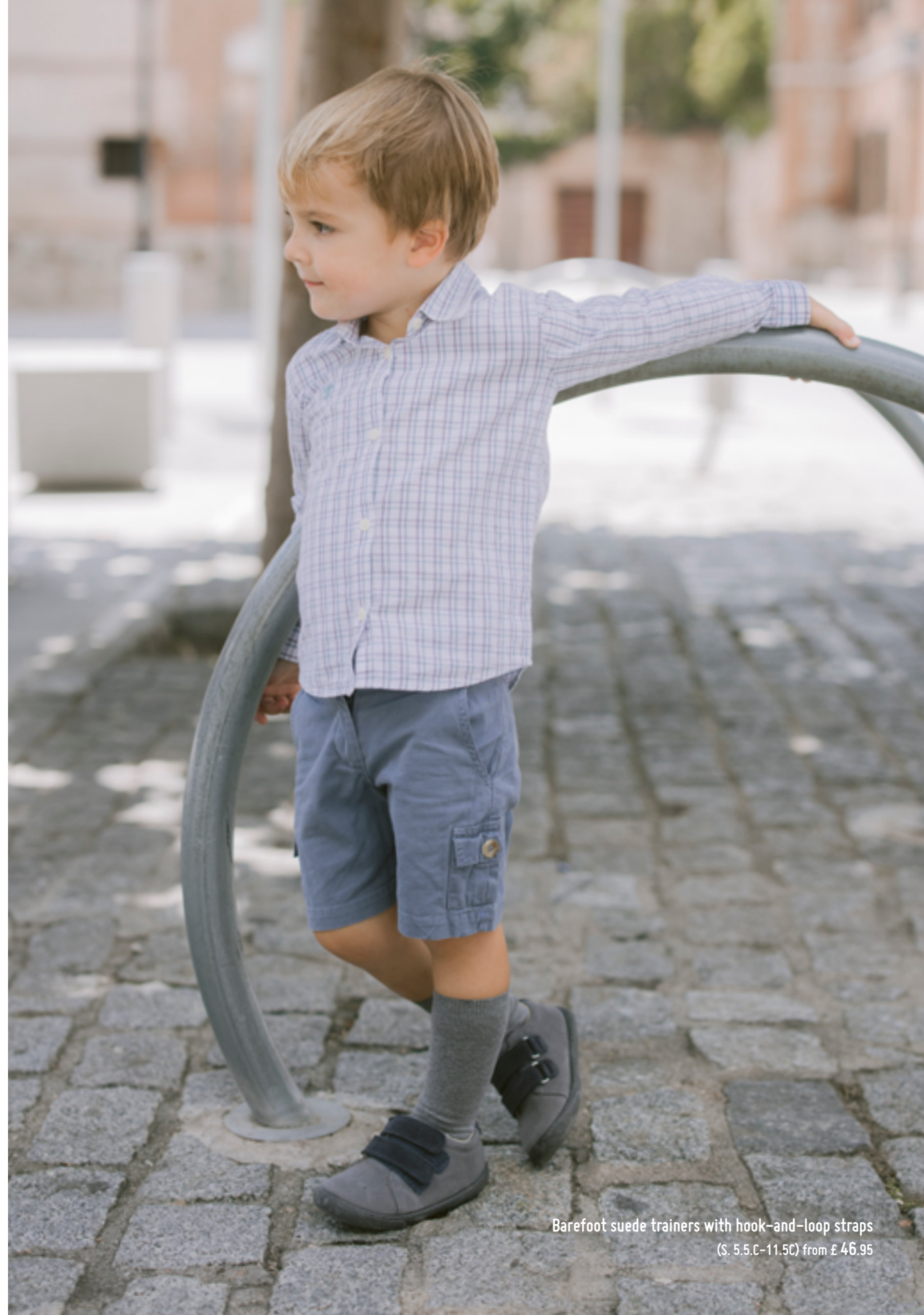
Barefoot suede trainers with hook-and-loop straps (S. 5.5C-11.5C) from £ 46.95