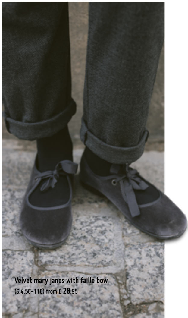
Velvet mary janes with faille bow (S. 4.5C-11C) from £ 28.95