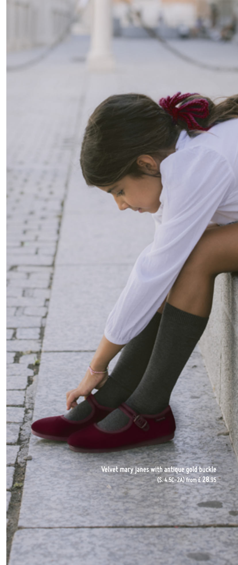
Velvet mary janes with antique gold buckle (S. 4.5C-2A) from £ 28.95