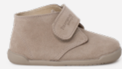
Barefoot suede boots with hook-and-loop closure (S. 3C-8.5C) £ 46.95