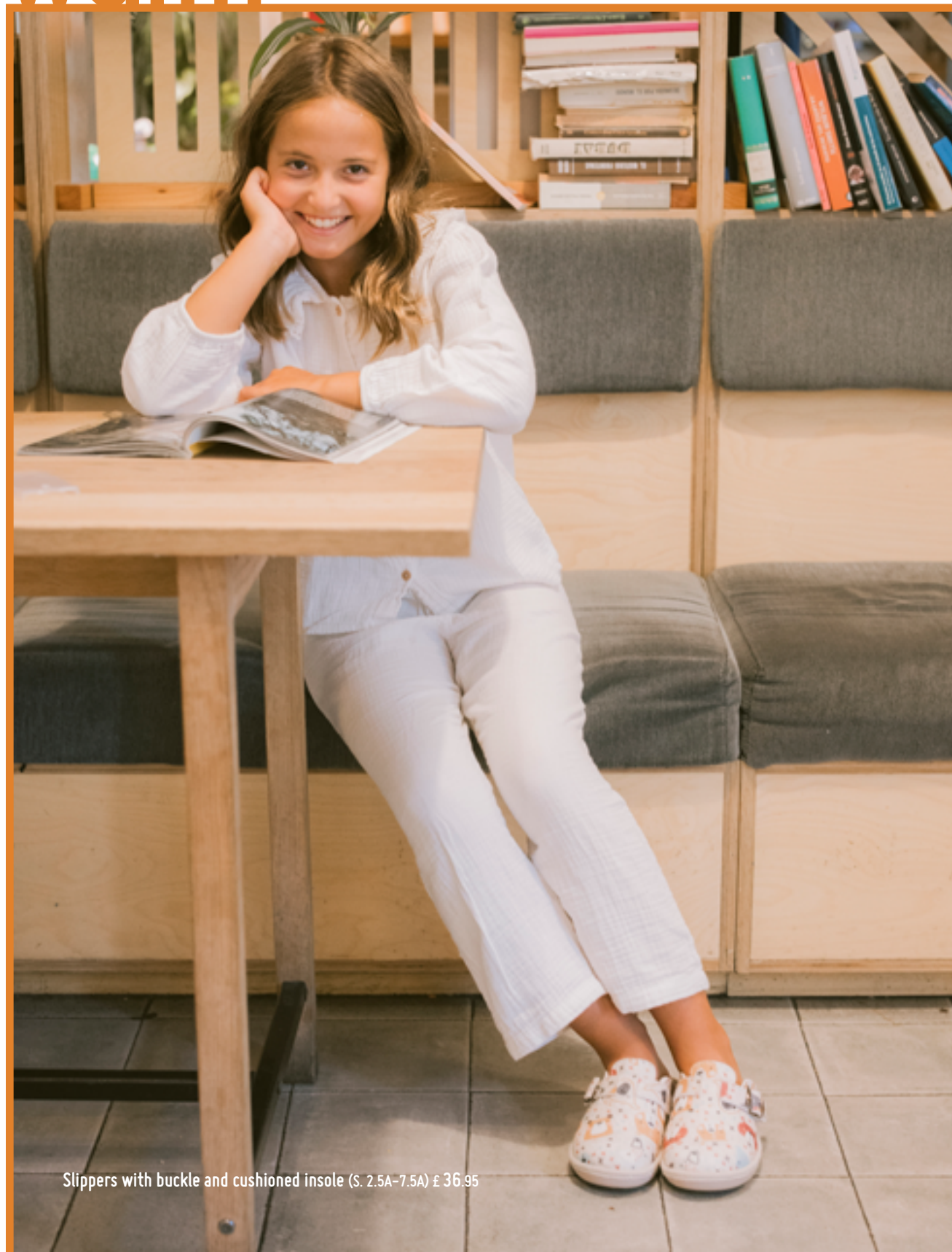
Slippers with buckle and cushioned insole (S. 2.5A-7.5A) £ 36.95