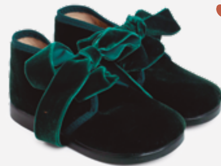
Velvet booties with a bow (S. 3C-8.5C) £ 36.95