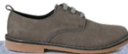
Waxed nubuck leather bluchers (S. 2.5A-7.5A) £ 47.95