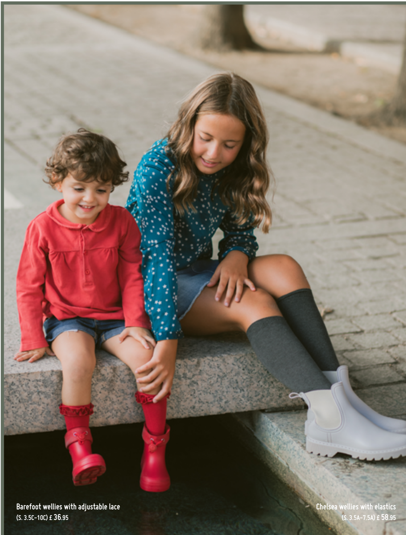
Barefoot wellies with adjustable lace (S. 3.5C-10C) £ 36.95