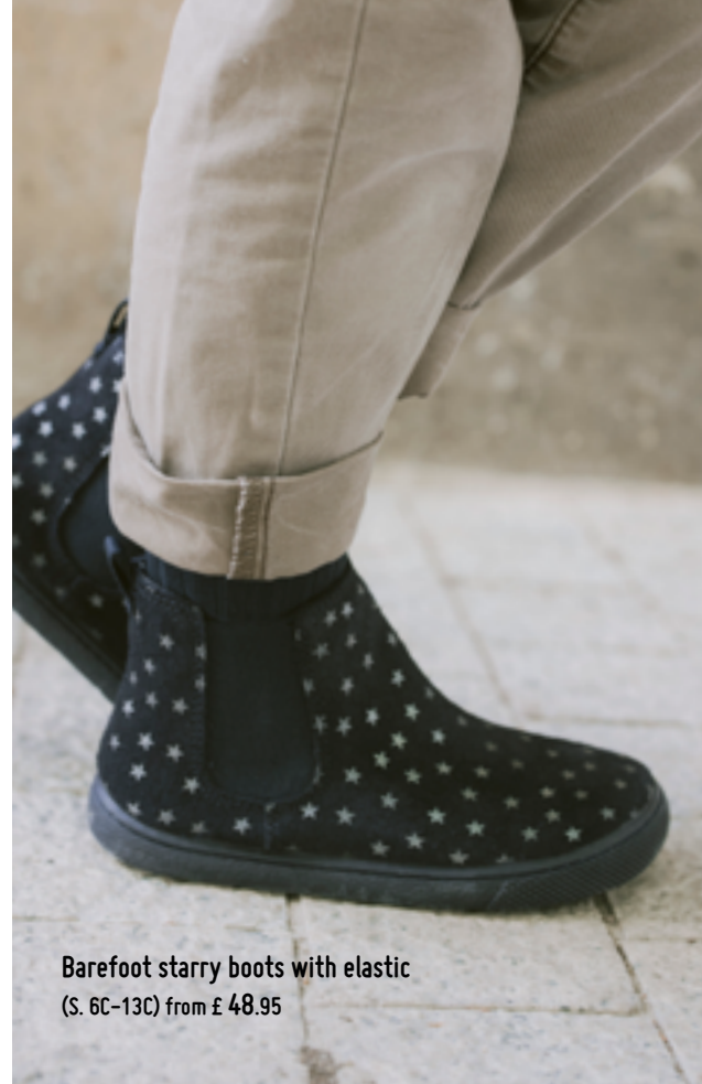
Barefoot starry boots with elastic (S. 6C-13C) from £ 48.95