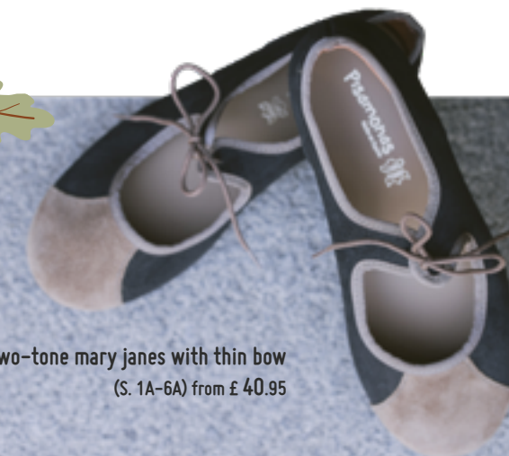
Two-tone mary janes with thin bow (S. 1A-6A) from £ 40.95