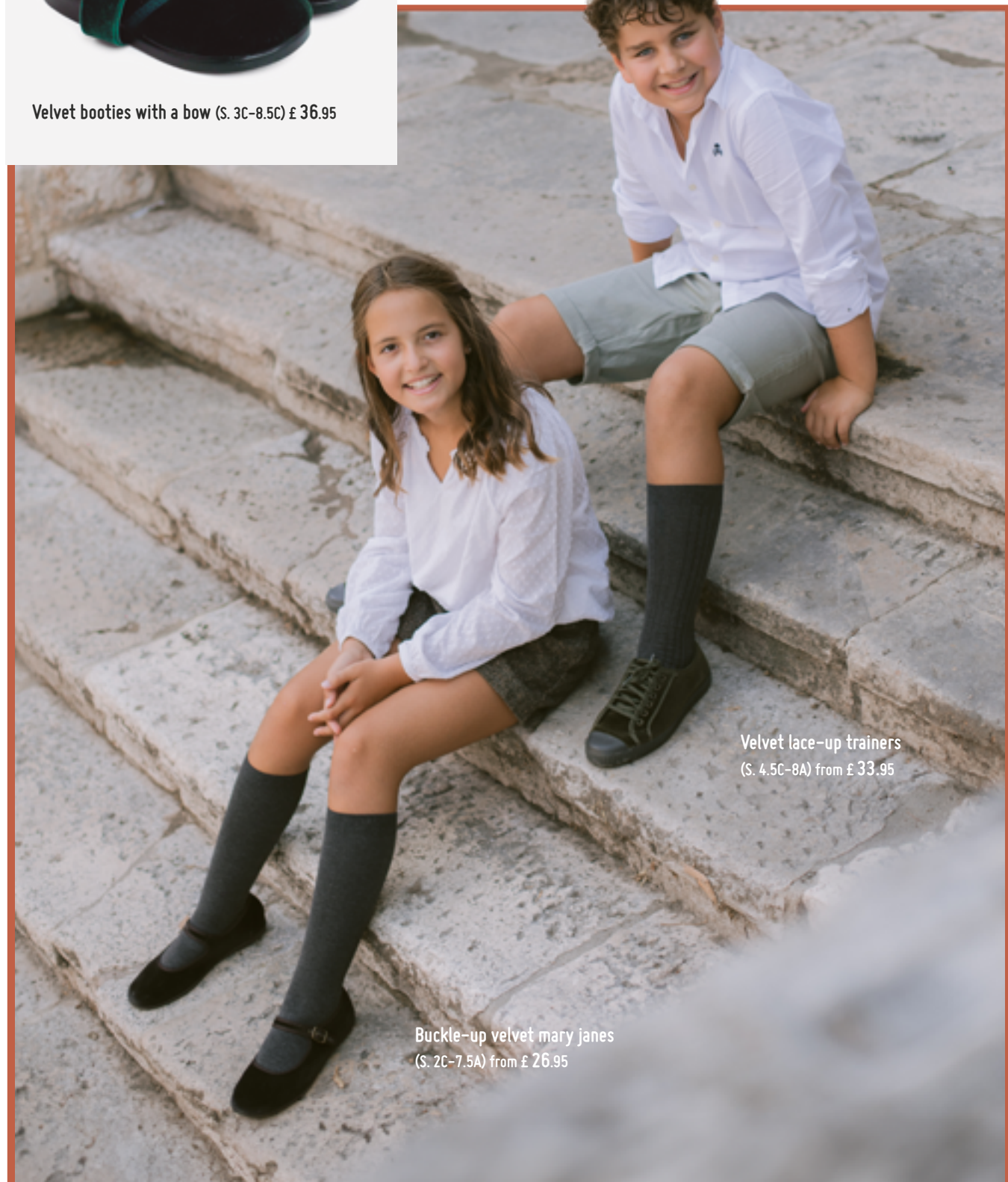
Velvet lace-up trainers (S. 4.5C-8A) from £ 33.95