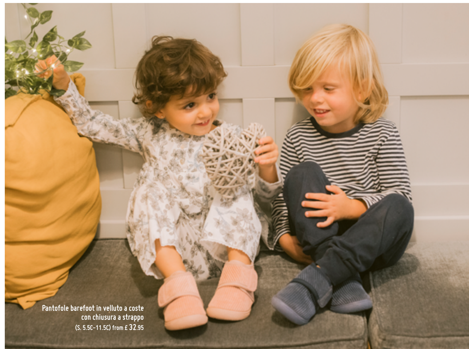
Pantofole barefoot in velluto a coste con chiusura a strappo (S. 5.5C-11.5C) from £ 32.95