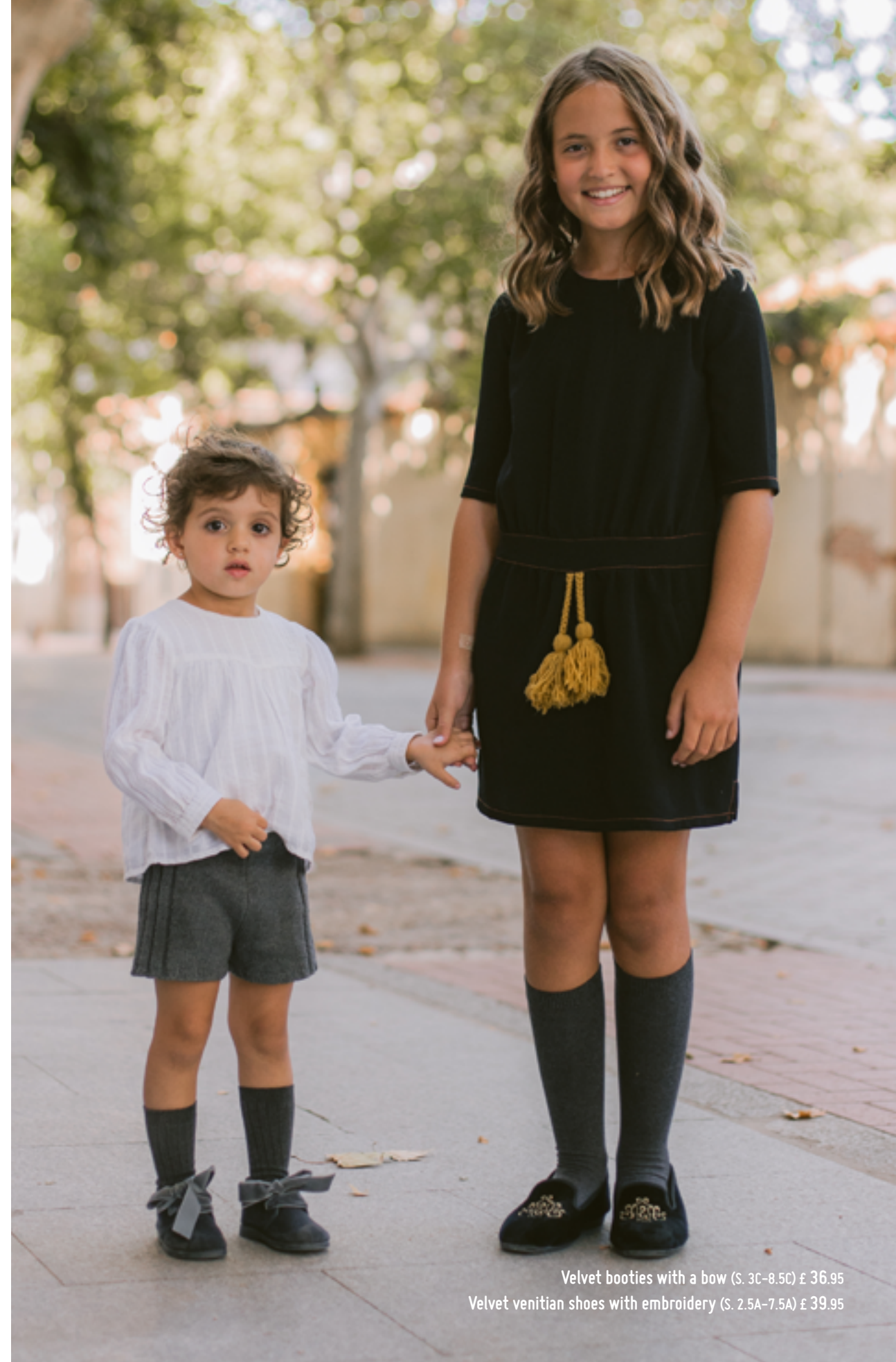
Velvet booties with a bow (S. 3C-8.5C) £ 36.95 Velvet venetian shoes with embroidery (S. 2.5A-7.5A) £ 39.95