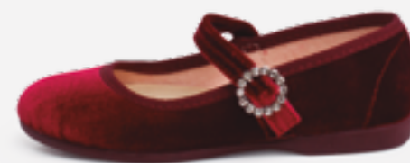
Velvet mary janes with jewel buckle (S. 7C-5A) from £ 35.95