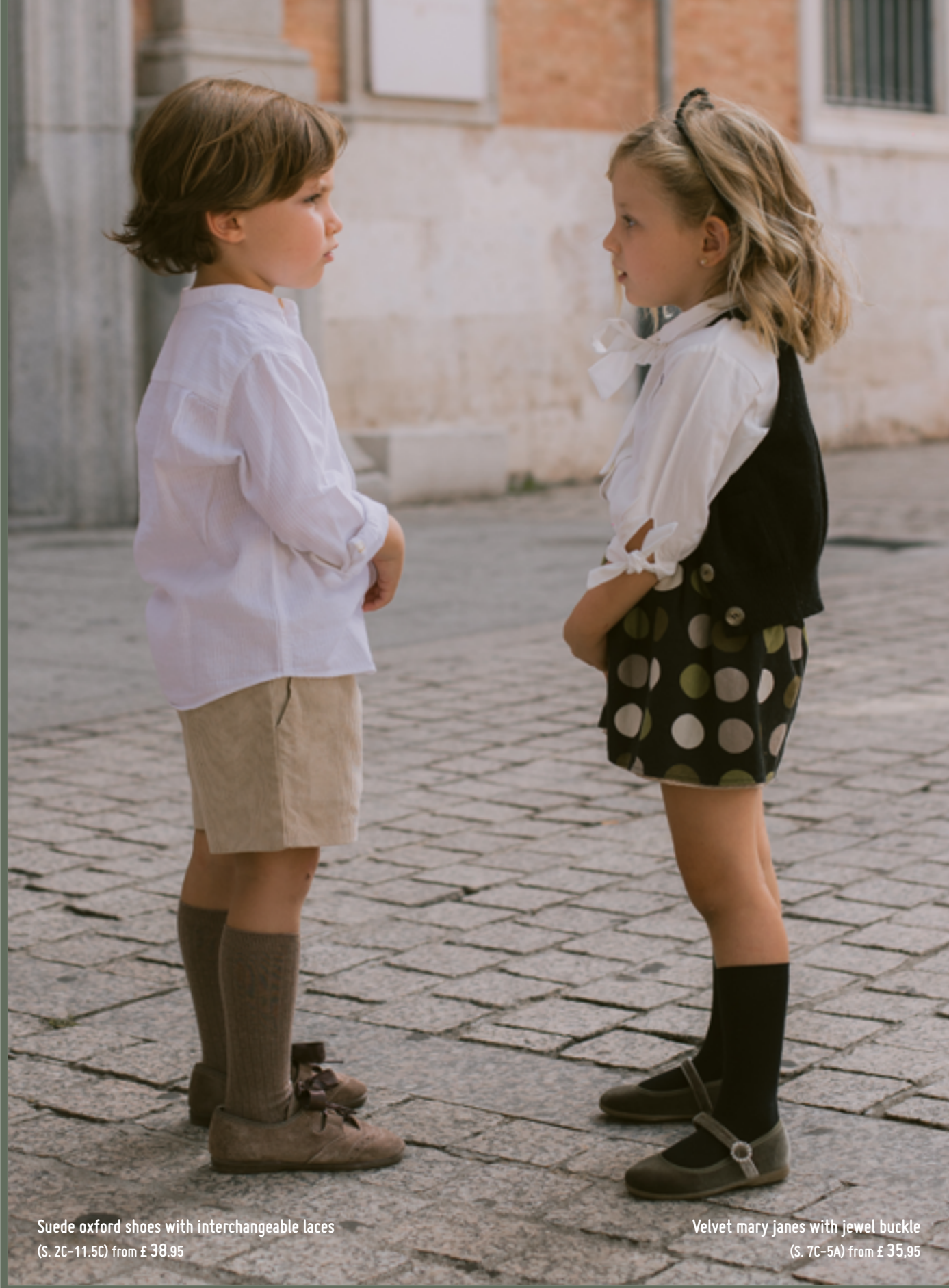
Suede oxford shoes with interchangeable laces (S. 2C-11.5C) from £ 38.95