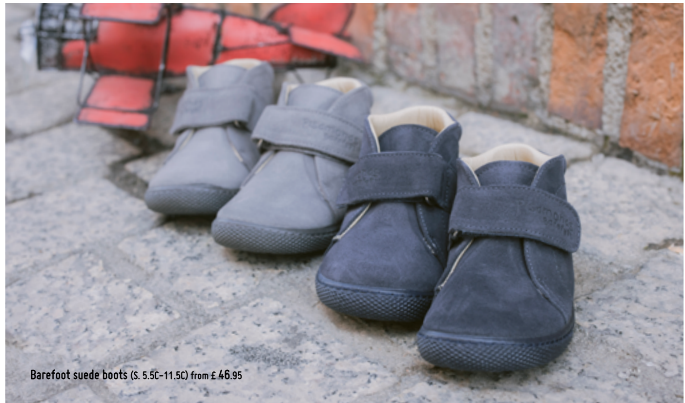
Barefoot suede boots (S. 5.5C-11.5C) from £ 46.95