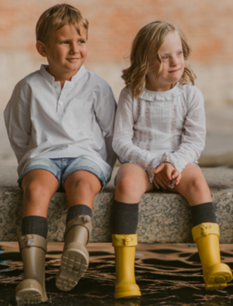
Flexible and adjustable wellies (S. 3.5C-13C) £ 38.95 Wellies with adjustable shaft (S. 3.5C-11.5C) £ 33.95