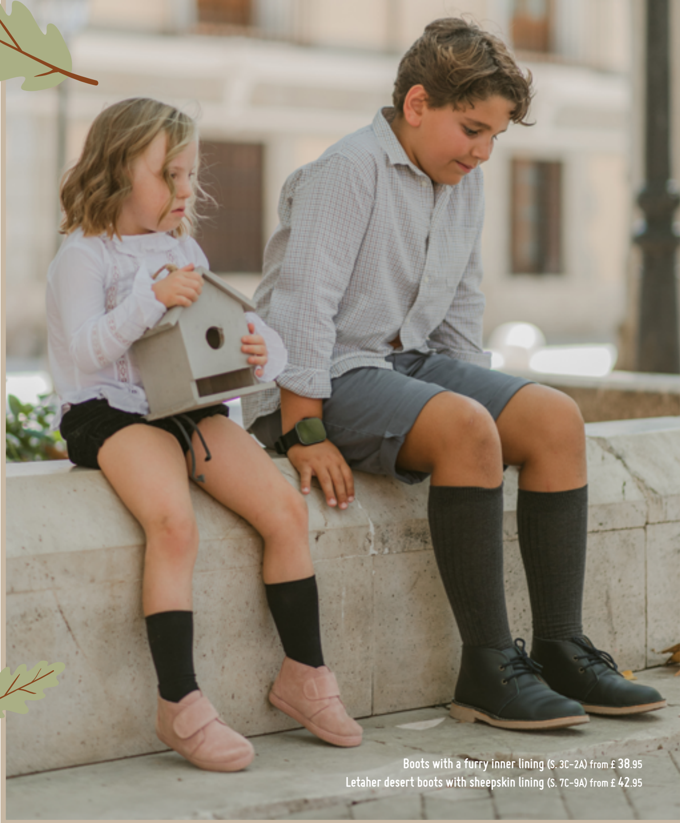
Boots with a furry inner lining (S. 3C-2A) from £ 38.95 Letaher desert boots with sheepskin lining (S. 7C-9A) from £ 42.95