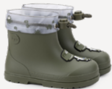
Barefoot adjustable dinosaur wellies (S.3.5C-10C) £ 39.95