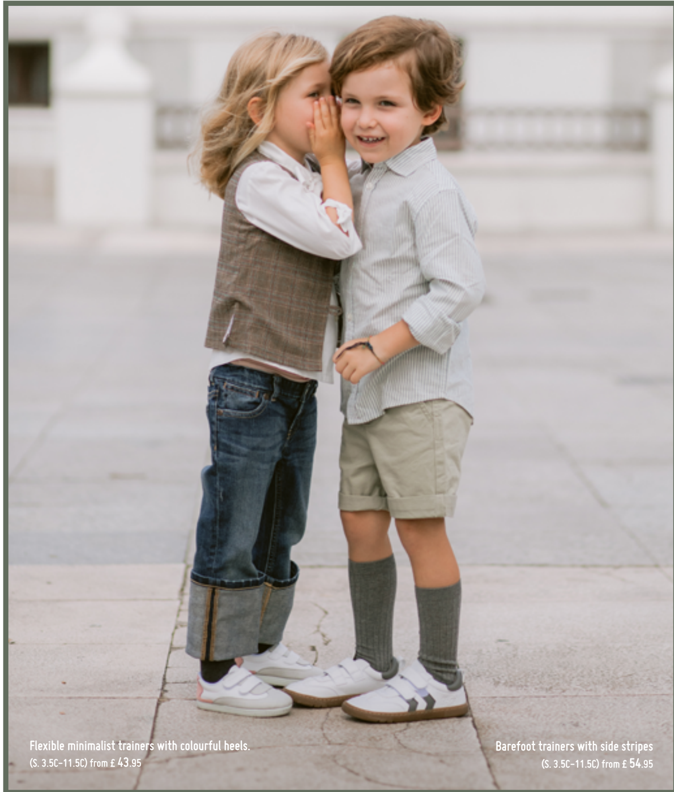
Flexible minimalist trainers with colourful heels. (S. 3.5C-11.5C) from £ 43.95