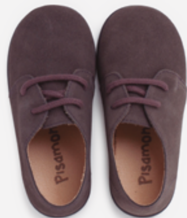
Suede lace-up brogues with thin sole (S. 3.5C-11.5C) £ 34.95