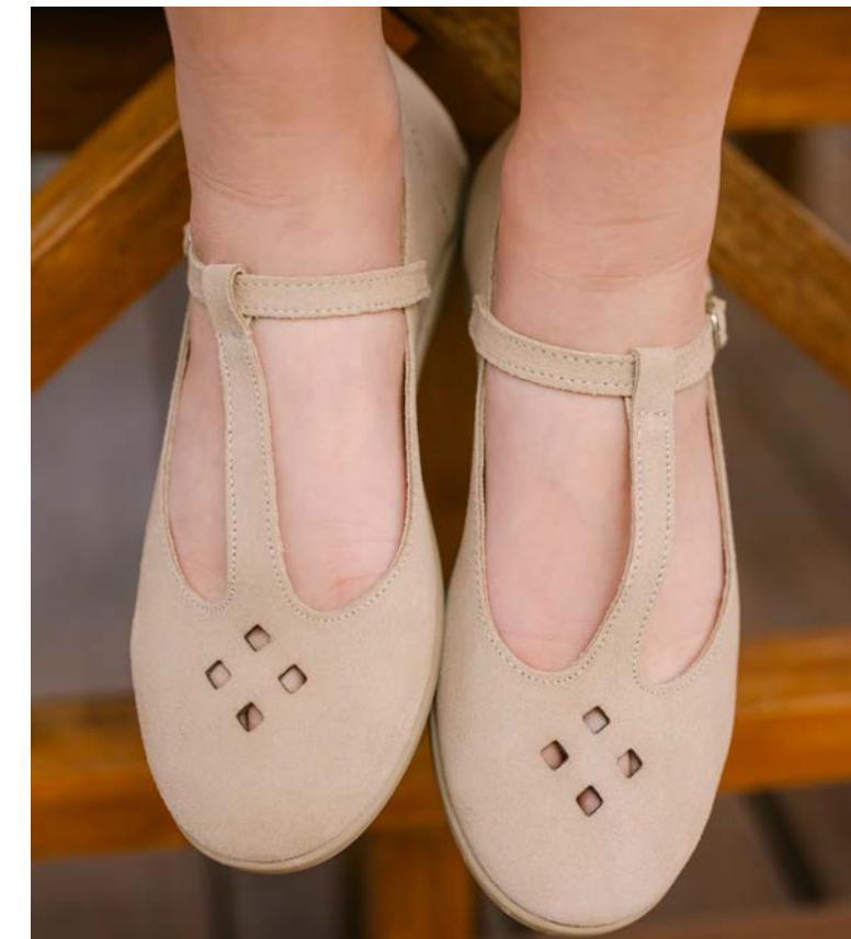
Perforated suede mary janes with t-bar strap (S. 10C-6A) from £ 46.95