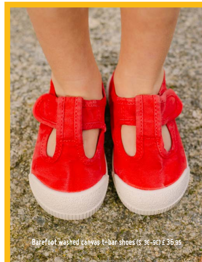
Barefoot washed canvas t-bar shoes (S. 3C-9C) £ 36.95