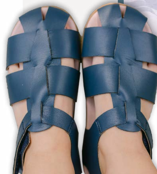
Leather barefoot strappy sandals (S. 3.5C-2A) from £ 50.95