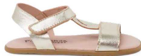
Barefoot sandals with metallic instep straps (S. 3.5C-2A) from £ 48.95