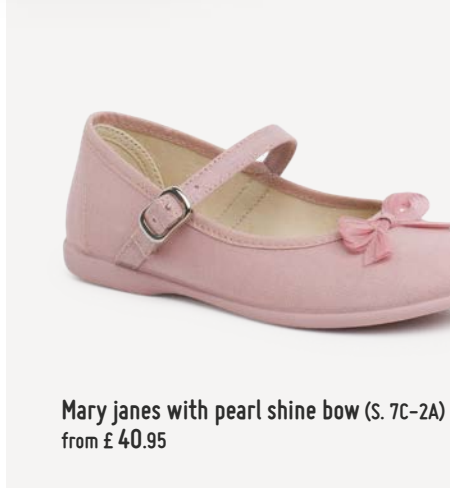
Mary janes with pearl shine bow (S. 7C-2A) from £ 40.95