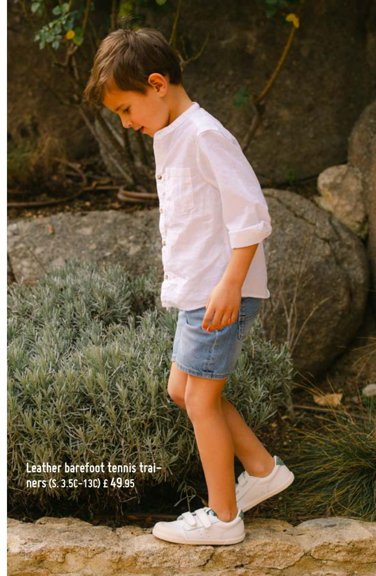
Leather barefoot tennis trainers (S. 3.5C-13C) £ 49.95