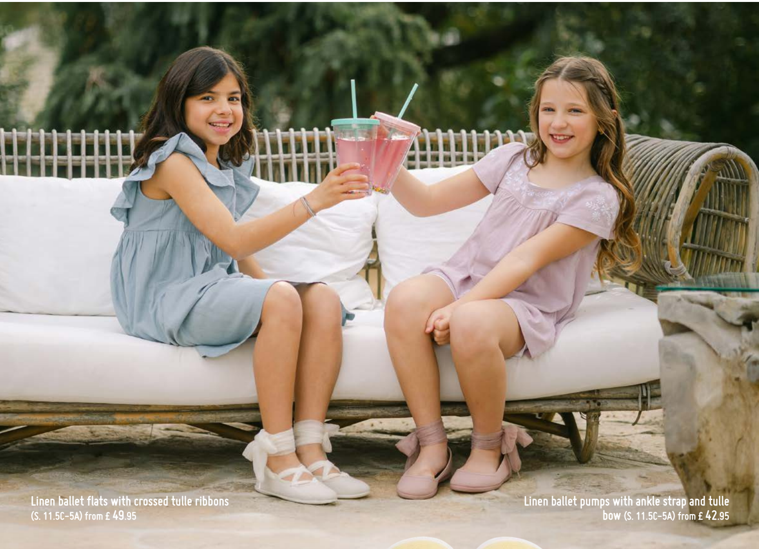
Linen ballet flats with crossed tulle ribbons (S. 11.5C-5A) from £ 49.95