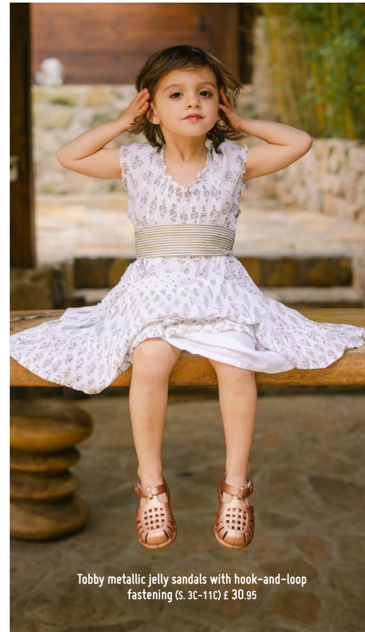
Tobby metallic jelly sandals with hook-and-loop fastening (S. 3C-11C) £ 30.95