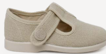
Linen t-bar shoes with hook-and-loop fastening button (S. 3C-8.5C) £ 30.95