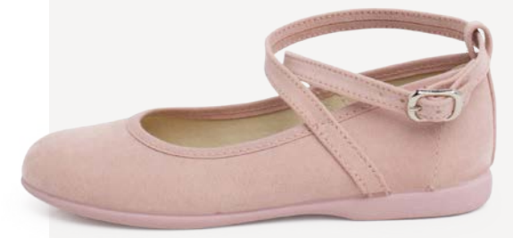
Suede effect mary janes with cross strap and buckle (S. 10C-5A) from £ 38.95