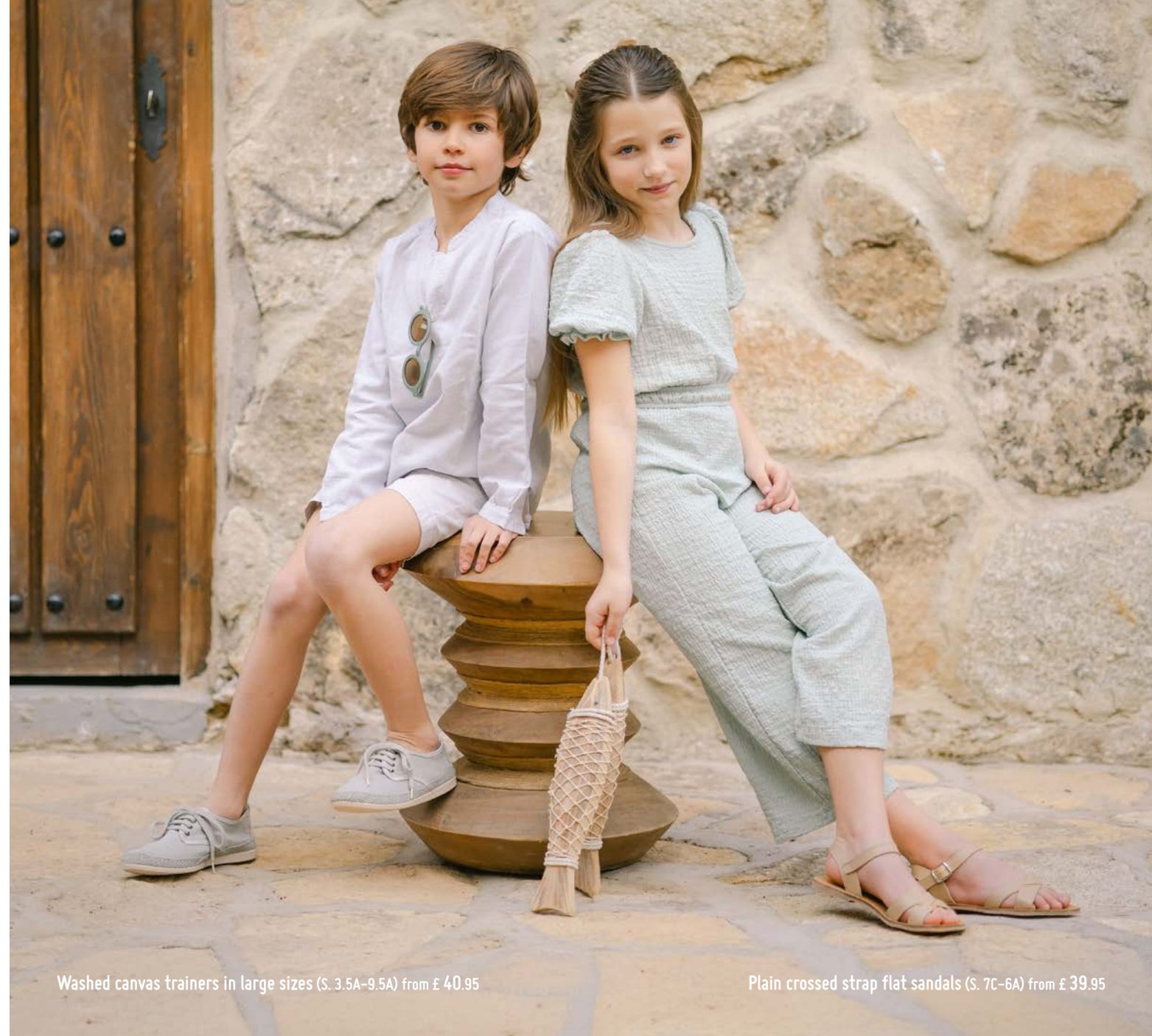
Washed canvas trainers in large sizes (S. 3.5A-9.5A) from £ 40.95