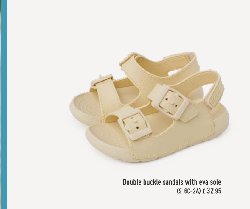
Double buckle sandals with eva sole (S. 6C-2A) £ 32.95