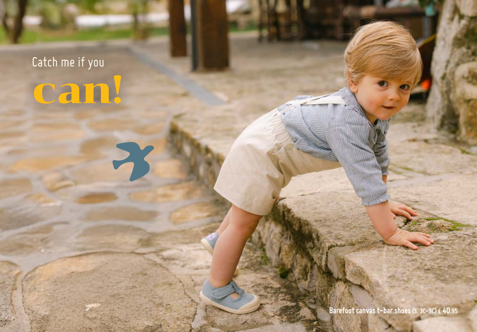
Barefoot canvas t-bar shoes (S. 3C-9C) £ 40.95