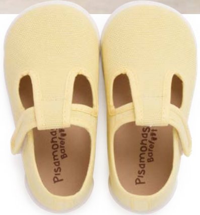
Barefoot rustic canvas t-bar shoes with hook-and-loop strap (S. 3.5C-8.5C) £ 36.95