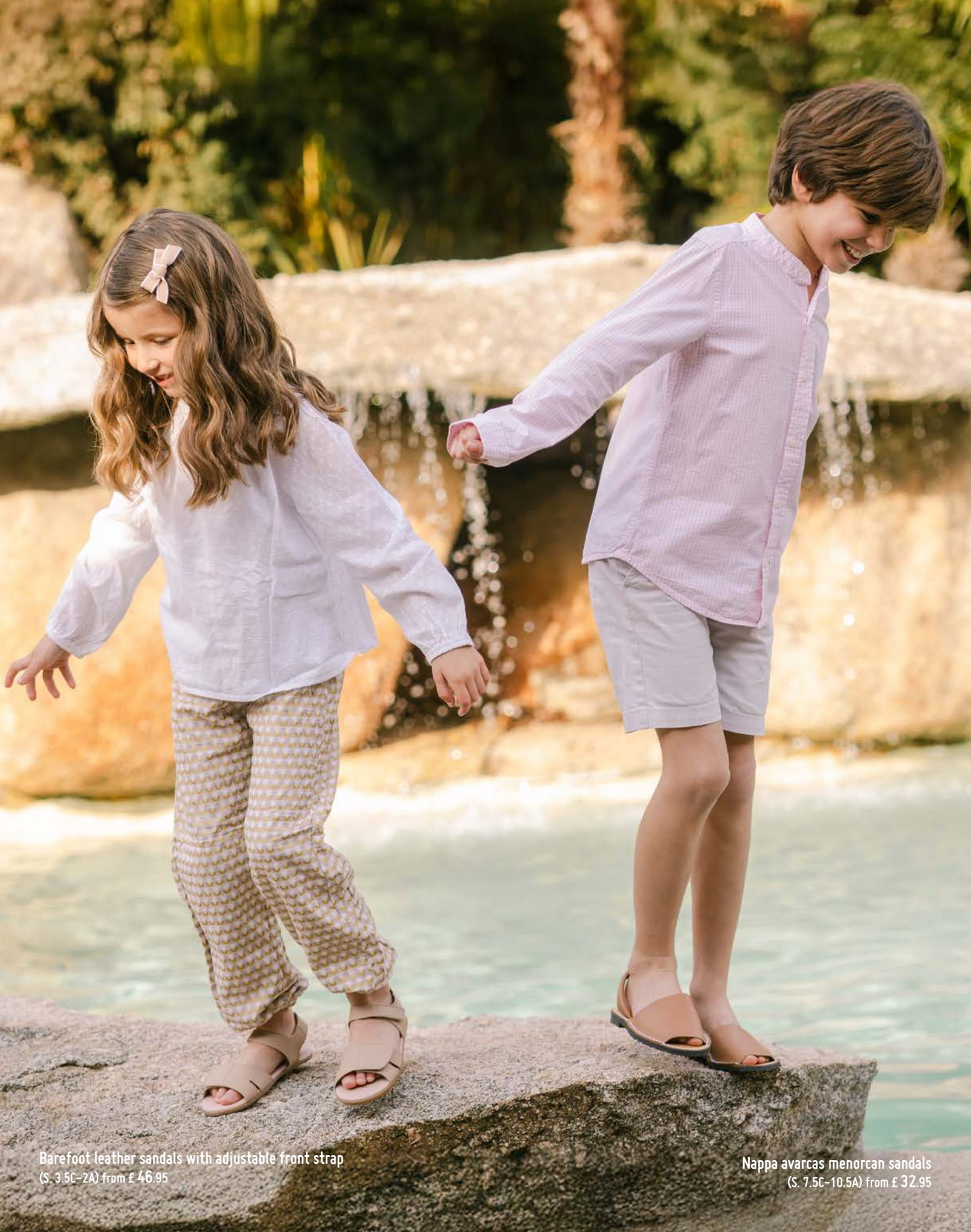
Barefoot leather sandals with adjustable front strap (S. 3.5C-2A) from £ 46.95