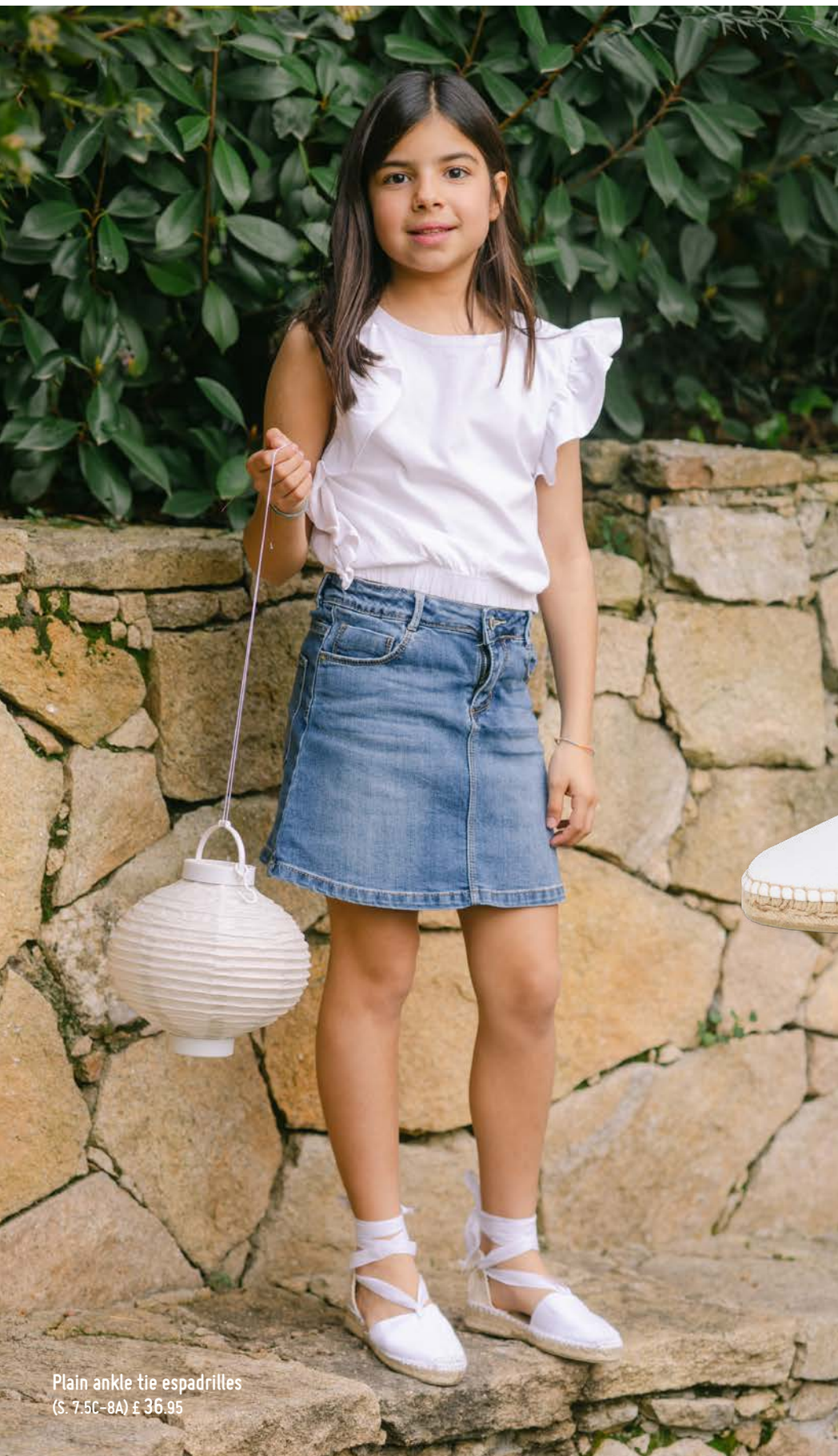
Plain ankle tie espadrilles (S. 7.5C-8A) £ 36.95