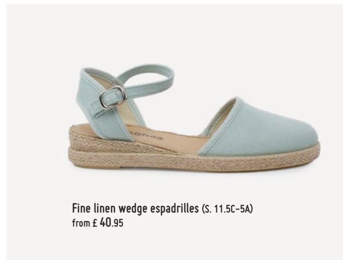
Fine linen wedge espadrilles (S. 11.5C-5A) from £ 40.95