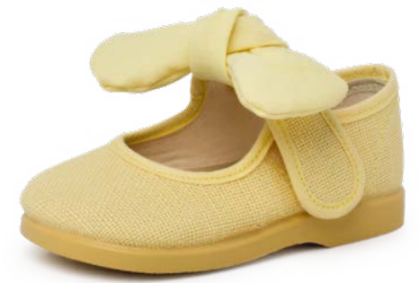
Linen mary janes with bow and hook-and-loop closure (S. 2C-8.5C) £ 30.95

On the following pages, you'll find craftsmanship, plenty of style, and the latest trends. Metallic tones, soft pastels and lightweight, breathable materials. Sleek, minimalist lines sit alongside new barefoot models that gently adapt to every foot, with the utmost attention to detail. Espadrilles, sandals and jelly shoes made for sunny days complete a collection designed for endless fun. Let the most beautiful season of the year begin!