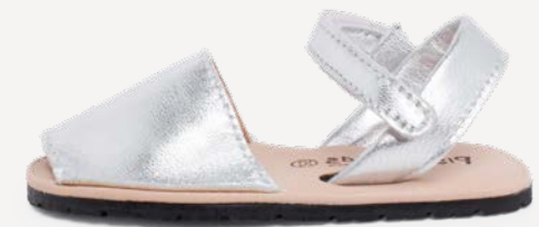
Soft avarcas sandals in metallic colours with flexible soles (S. 4.5C-13C) from £ 42.95