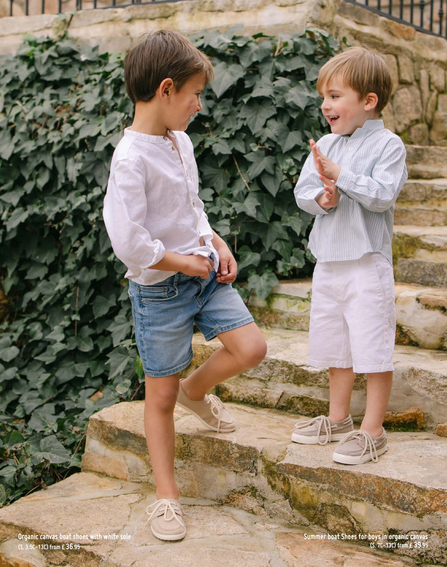
Organic canvas boat shoes with white sole (S. 3.5C-13C) from £ 36.95