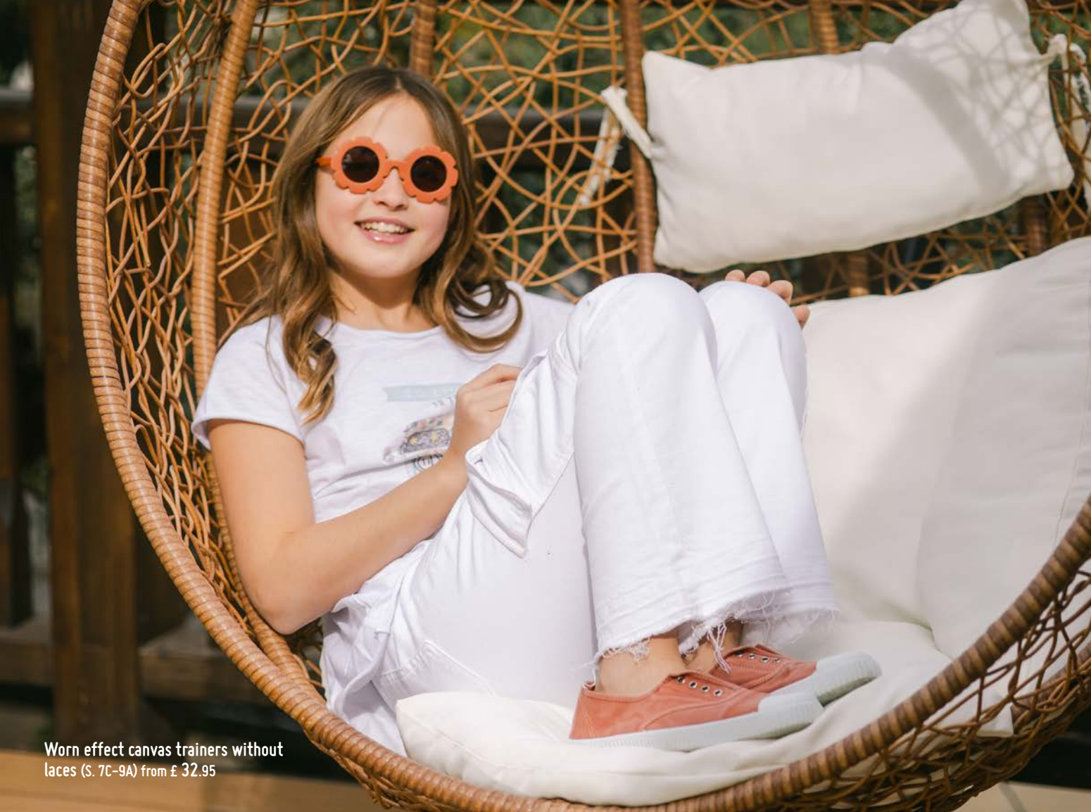
Worn effect canvas trainers without laces (S. 7C-9A) from £ 32.95