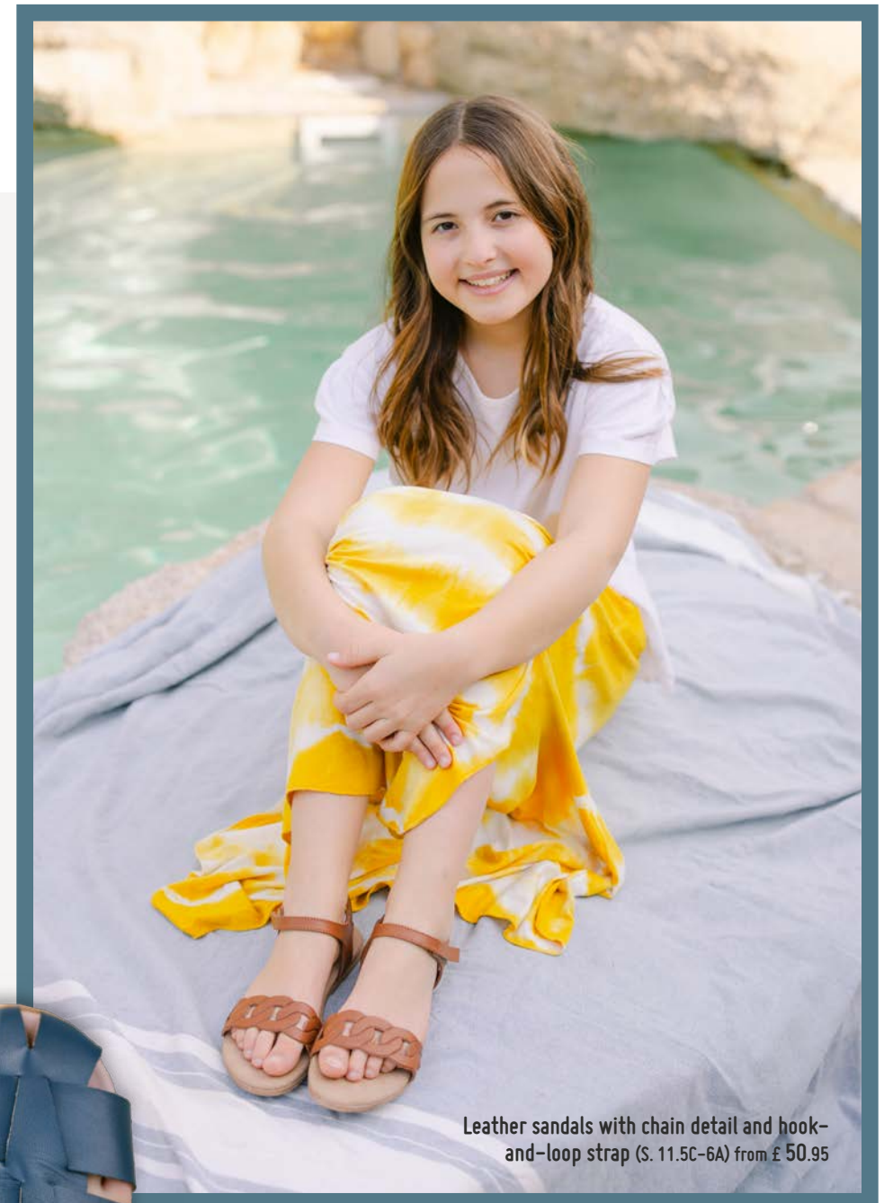
Leather sandals with chain detail and hook-and-loop strap (S. 11.5C-6A) from £ 50.95