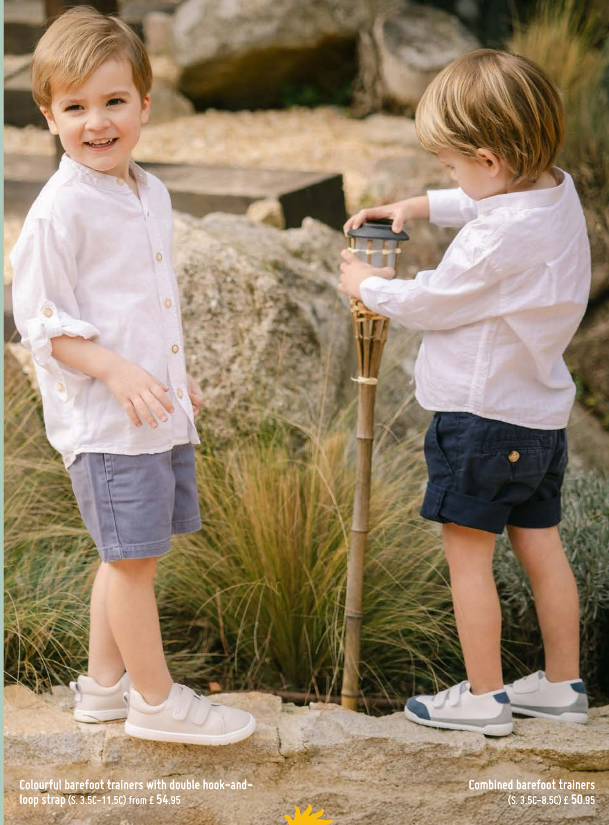
Colourful barefoot trainers with double hook-and-loop strap (S. 3.5C-11.5C) from £ 54.95