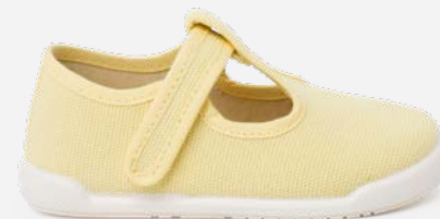
Barefoot rustic canvas t-bar shoes with hook-and-loop strap (S. 3.5C-8.5C) £ 40.95