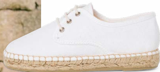
Canvas bluchers with jute sole (S. 7C-7.5A) from £ 40.95