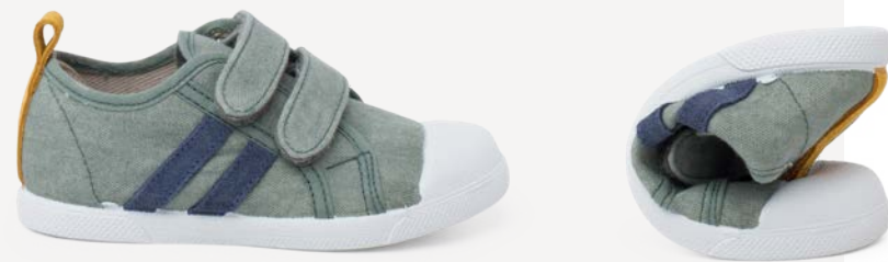
Soft eco canvas trainers combined colours (S. 5.5C-13C) from £ 42.95