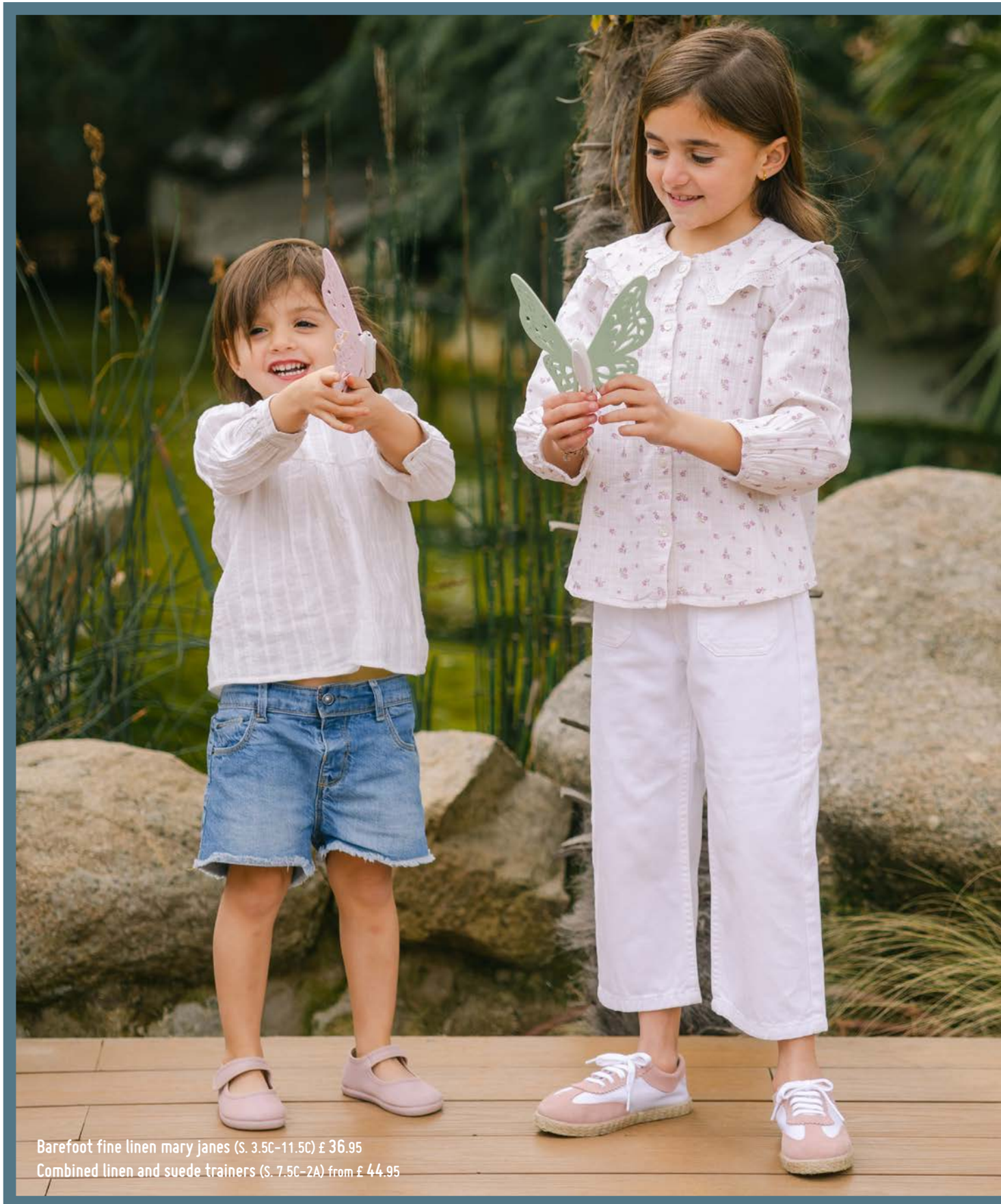
Barefoot fine linen mary janes (S. 3.5C-11.5C) £ 36.95