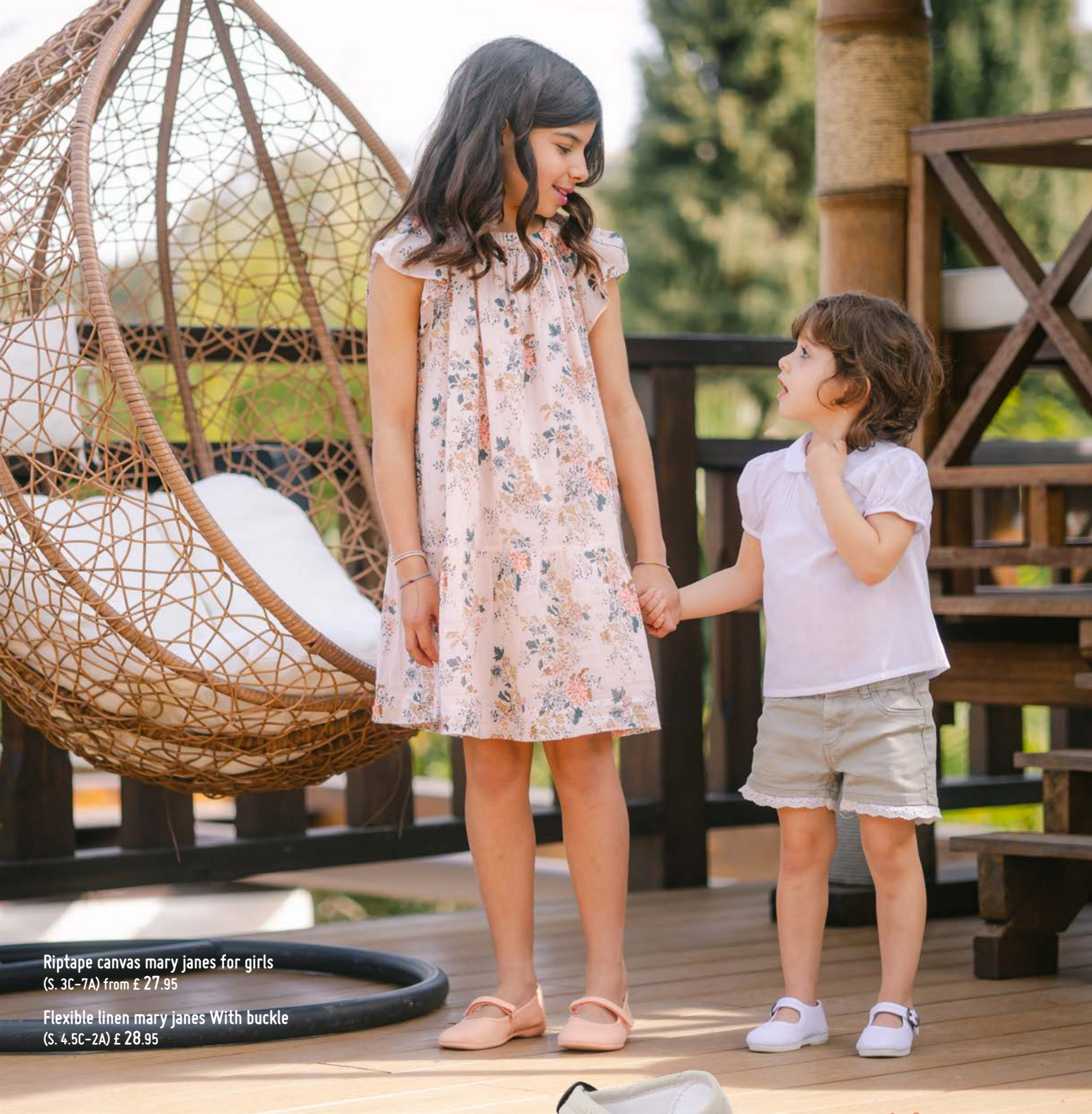
Riptape canvas mary janes for girls (S. 3C-7A) from £ 27.95