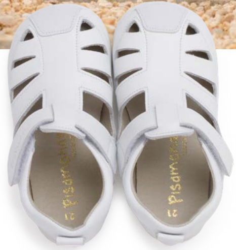
Soft leather sandals with thin sole (S. 3C-8.5C) £ 54.95