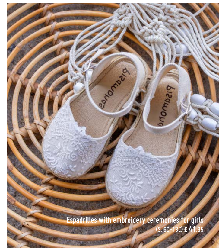
Espadrilles with embroidery ceremonies for girls (S. 6C-13C) £ 41.95