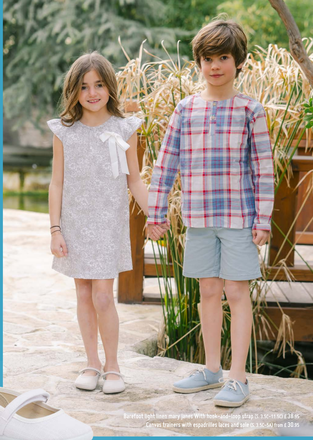
Barefoot light linen mary janes With hook-and-loop strap (S. 3.5C-11.5C) £ 38.95 Canvas trainers with espadrilles laces and sole (S. 3.5C-5A) from £ 30.95