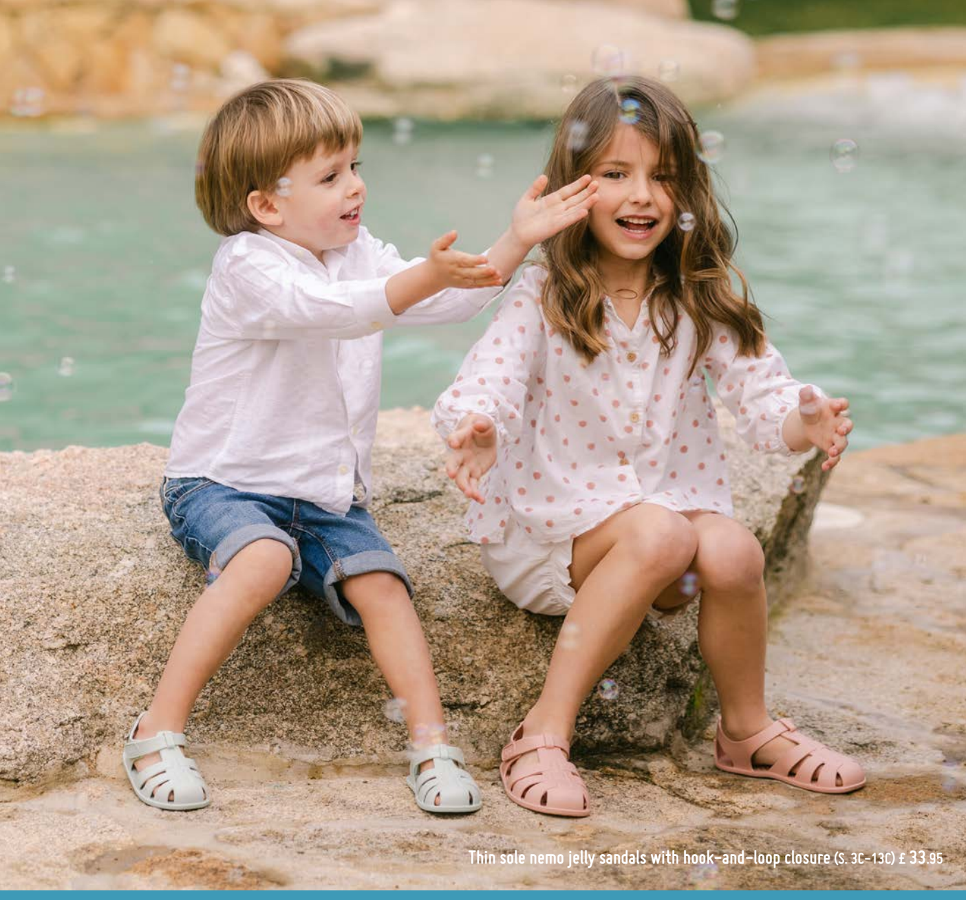
Thin sole nemo jelly sandals with hook-and-loop closure (S. 3C-13C) £ 33.95