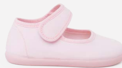
Barefoot canvas mary-janes with wide strap (S. 3.5C-11.5C) £ 34.95