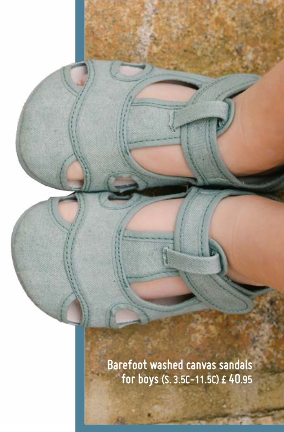
Barefoot washed canvas sandals for boys (S. 3.5C-11.5C) £ 40.95