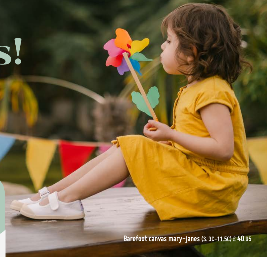
Barefoot canvas mary-janes (S. 3C-11.5C) £ 40.95